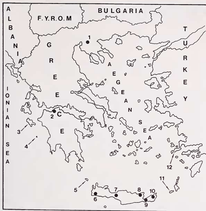
Fig. 1. Map of Greece indicating the Mus sampling localities. 1: Langadikia, Macedonia. 2: Patra, Peloponnese, 3, 4: Zakynthos and Strofades islands (Ionian Sea). 5: Antikythira island. 6: Paleochora. 7: Spili. 8: Milatos. 9: Between Ierapetra and Ag. Nikolaos. 10: Sitia (localities 6–10 are on Crete island). 11, 12: Kasos and Kos islands (Dodecanisa archipelago, Aegean Sea). All mice collected were of the feral ecotype except those of Patra which were of both the commensal and feral ones.

between the albumins of the taxa being compared. As representative material of the two known Greek taxa, M. m. domesticus and M. macedonicus , mice from Patra ( n=30 ) and Langadikia ( n=18 ) were used, respectively. In addition, mice from Crete ( n=30 ) were also tested, since we considered their taxonomic position ambiguous.